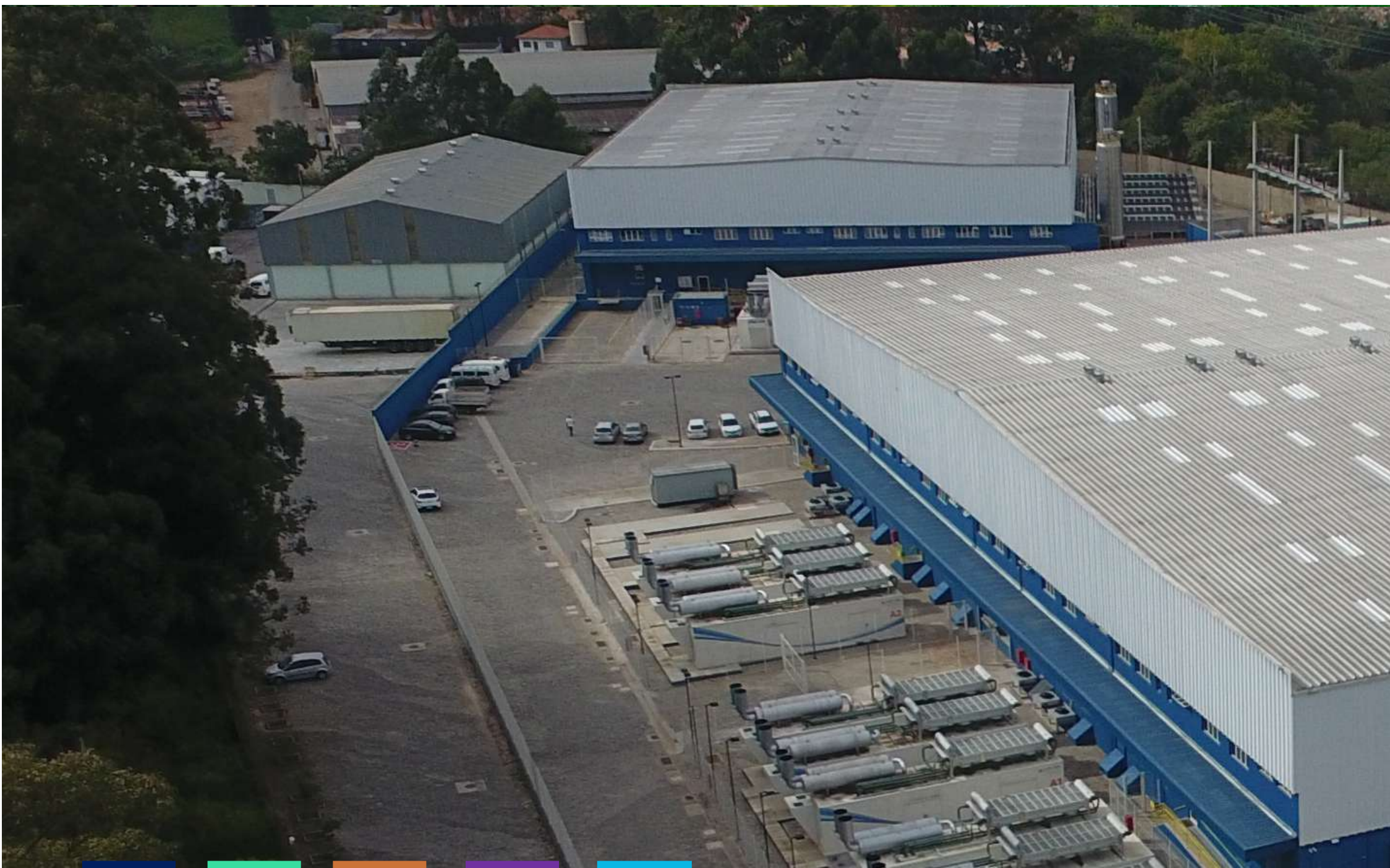
Data Center São Paulo 3